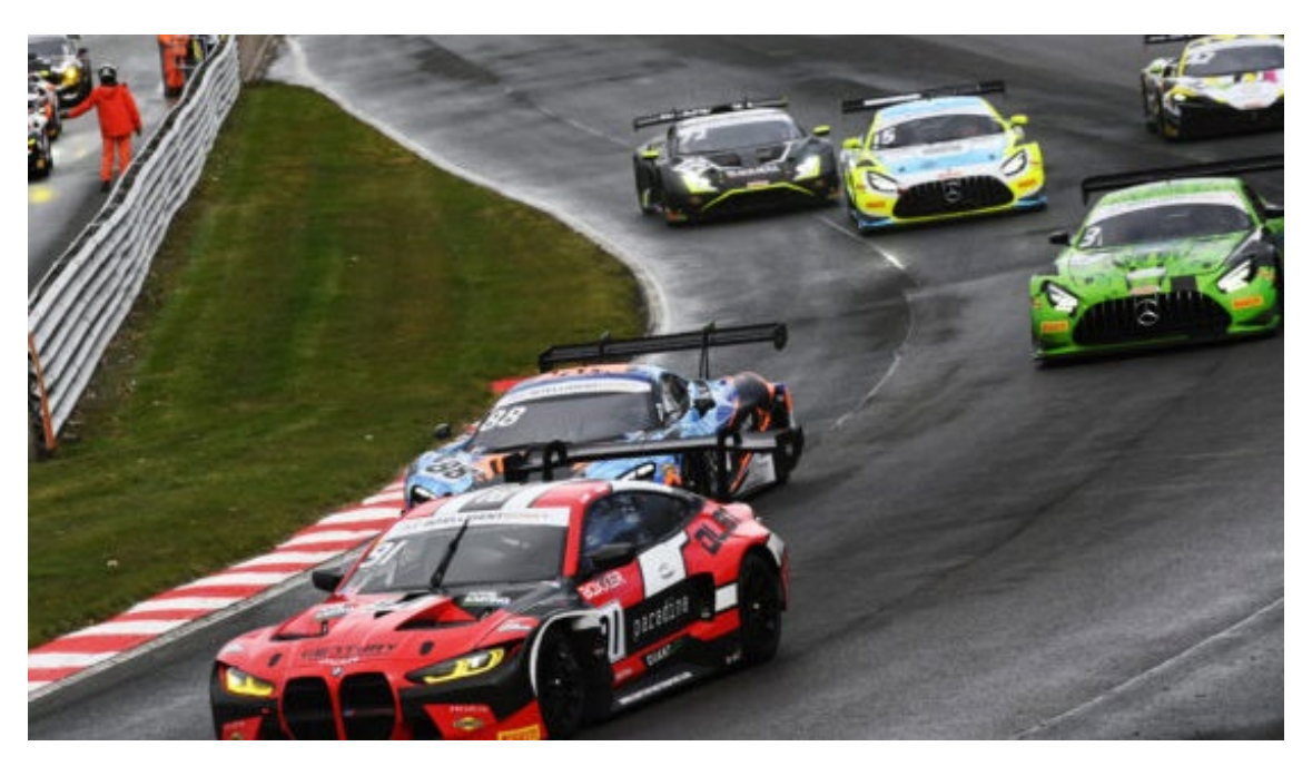
Century Motorsport Shows Potential In British GT