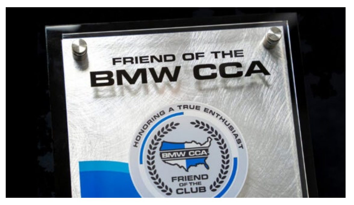
BMW CCA's 2022 Awards Program Now Accepting Nominations

The BMW CCA Recognition Program Committee (RPC) would like to thank everyone who contributed to the success of the 2021 [...]