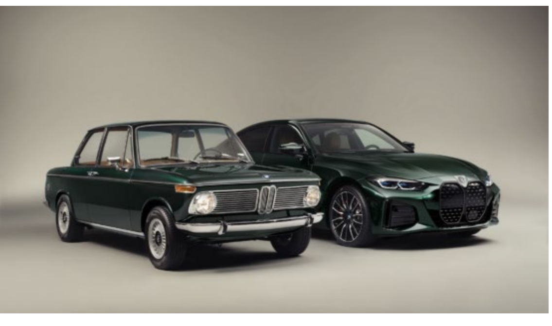
New Classic and Modern Kith BMWs Make Their Debut