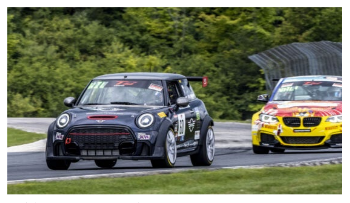
Mini Rules At Road America