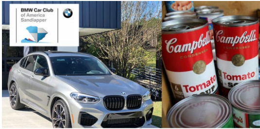
FOOD DRIVE FOR FAMILIES IN NEED