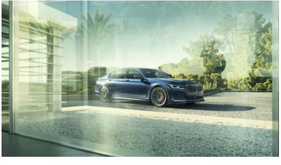
The 2020 Alpina B7 xDrive Is A 205-MPH Super Sedan

Zero to 60 in 3.5 seconds, a top speed of over 200 mph, four doors, and a curb weight that [...]