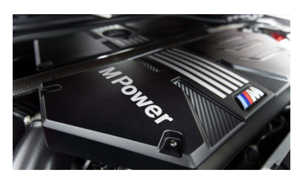
BMW Reveals New S58 M Inline-Six Powerhouse

The X3 and X4 M are here, and as we've been speculating for quite some time now, they've come with [...]