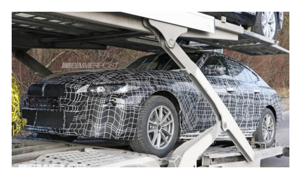
Potential i4 Prototype Spied Wearing Next-Gen 4 Series Gran Coupe Body

According to a recent forum thread that appeared on BimmerPost, the camouflaged prototype captured on a car hauler somewhere in Europe visible [...]