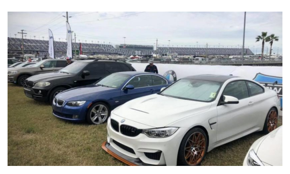
BMW CCA Corral Brings Members Into The Action At Rolex 24

This year's Rolex 24 at Daytona was among the most dramatic in recent memory, culminating in a BMW class victory [...]