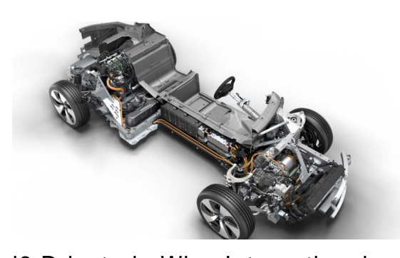
i8 Drivetrain Wins InternationalEngine Of The Year Award FourthYear In A Row

The innovative and game-changing hybridelectric drivetrain of the BMW i8 recently secured a fourth successive victory, receiving yet another Engine [...]