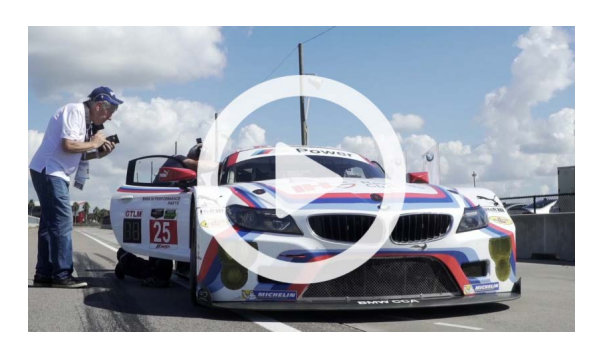
Video: BMW CCA Charity Hot Laps At Oktoberfest

One of the most unique opportunities at any BMW CCA Oktoberfest Presented by Michelin is the chance to see (and [...]